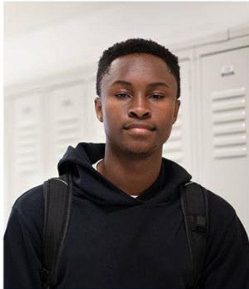
High School Based