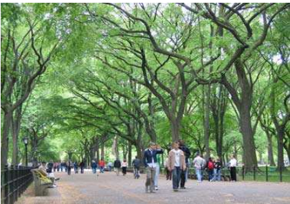
American Elm (summer)