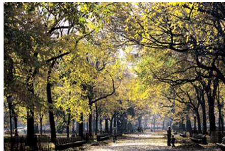
American Elm (fall)